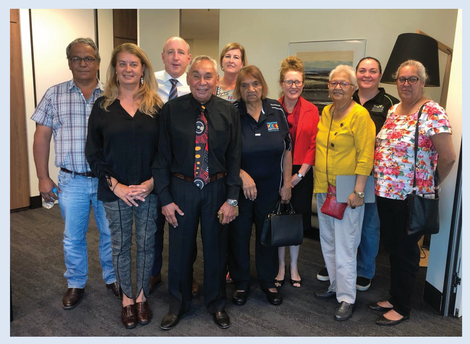
Meeting with Minister Howarth