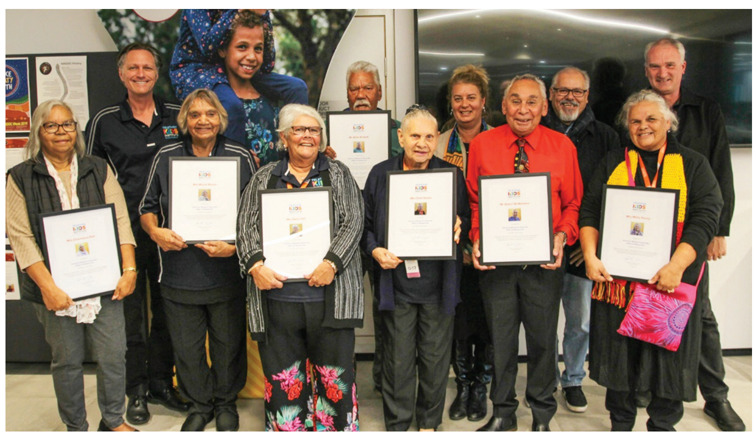
Telethon Kids Institute Honorary Research Associate presentation